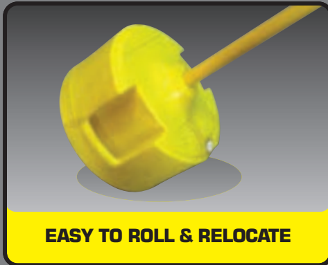
EASY TO ROLL & RELOCATE