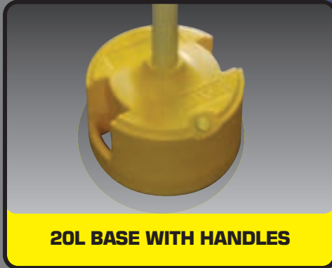
20L BASE WITH HANDLES