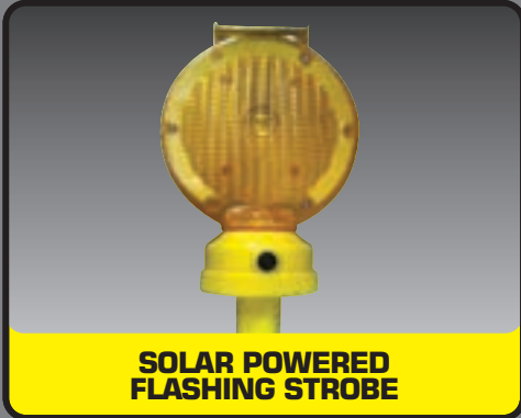
SOLAR POWERED FLASHING STROBE